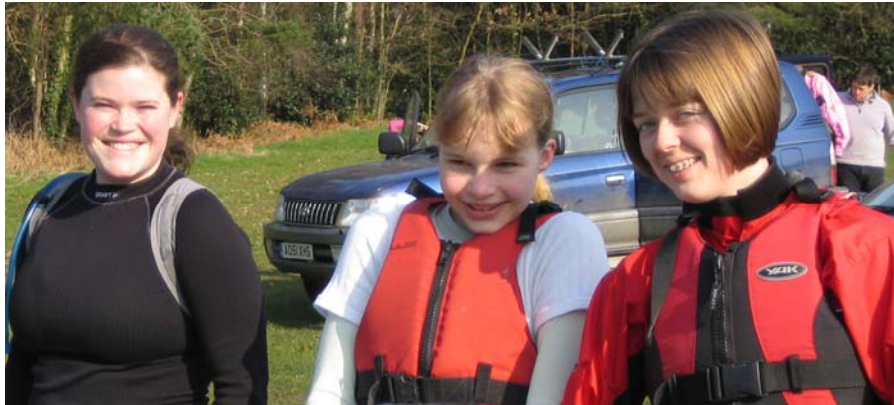
Ladies in waiting before the March Hare & Hounds

19 April Southern Region training @ Mytchett for under 13's